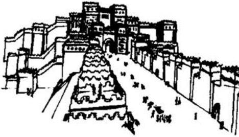
An artist's impression of "great Babylon".

The southern kingdom was then taken captive to Babylon for seventy years.