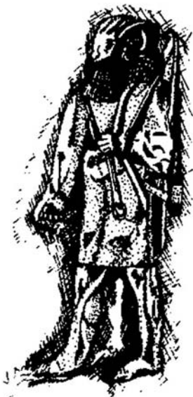
An Assyrian soldier from the palace of Sargon II. He had a curled beard, and held a quiver and bow, heavy club and sword.

2 Kings 18 and 19 The Assyrians invaded Judah, conquering virtually all the kingdom except the city of Jerusalem. This occurred during the time when Hezekiah was King of Judah.